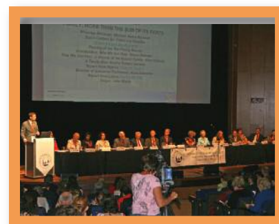
WCF V Amsterdam