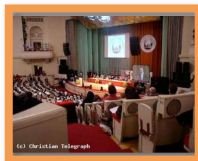
WCF IV Warsaw