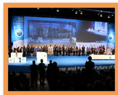
WCF VI Madrid