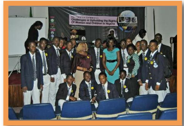
2011 Nigerian Regional Conference